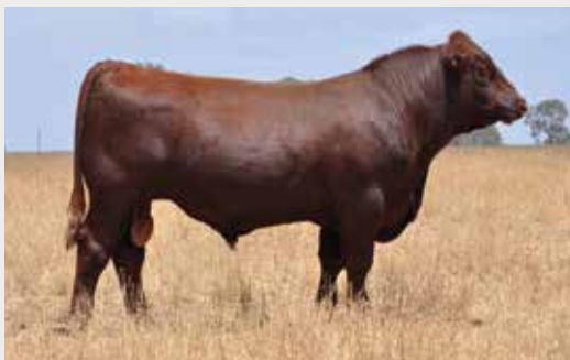
Eloora Icon P91