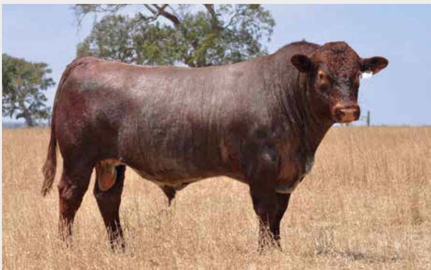
ELOORA IDEAL P05 SIRE JSF GOLDENROD 57U