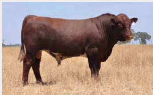
Eloora Impact P75