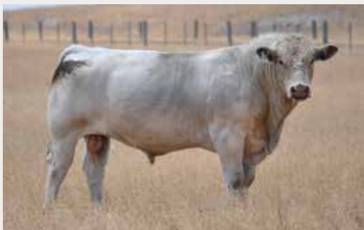
Eloora Ice Breaker P84