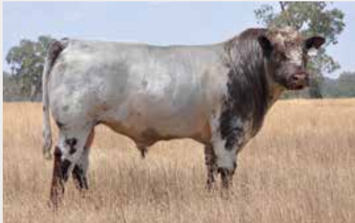
Eloora Inverell P29