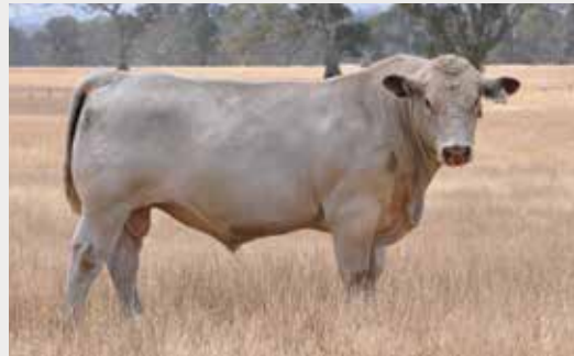
Eloora Ice White P31