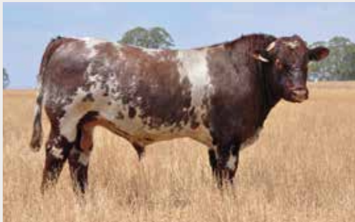
Eloora Indestructable P33