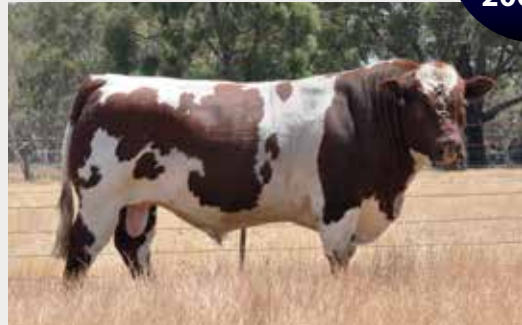
Eloora Ignite P43